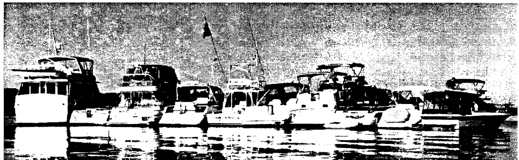
Dinghy Regatta Raft-Up—In addition to these 10 boats, which remained overnight August 23, another five OYC boats attended.