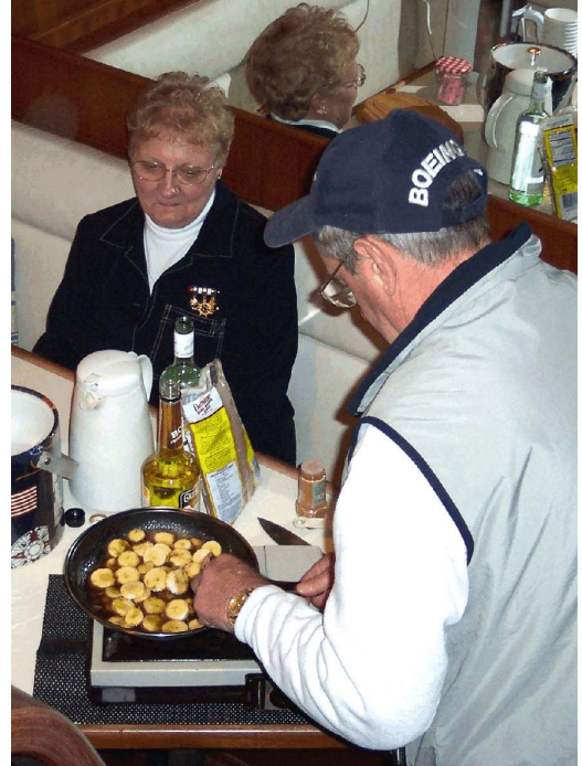
These Bananas are Best Served with Ice Cream – Not Cereal.