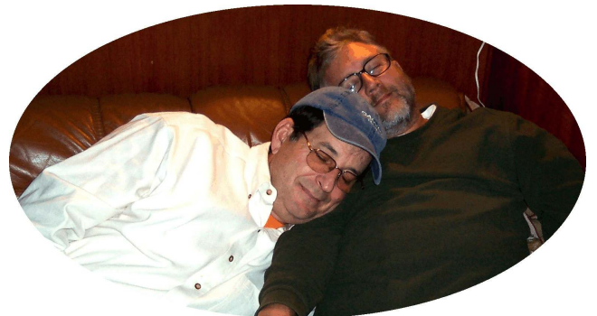
When told that Santa would soon be here, they quickly fell asleep with visions of new boat toys under the tree.

The afternoon warmed up to a balmy 60 degrees (and sunny) for a truly beautiful last ride home. We had another successful Hardy Souls Cruise and I hope we can go back to Old Towne next year.