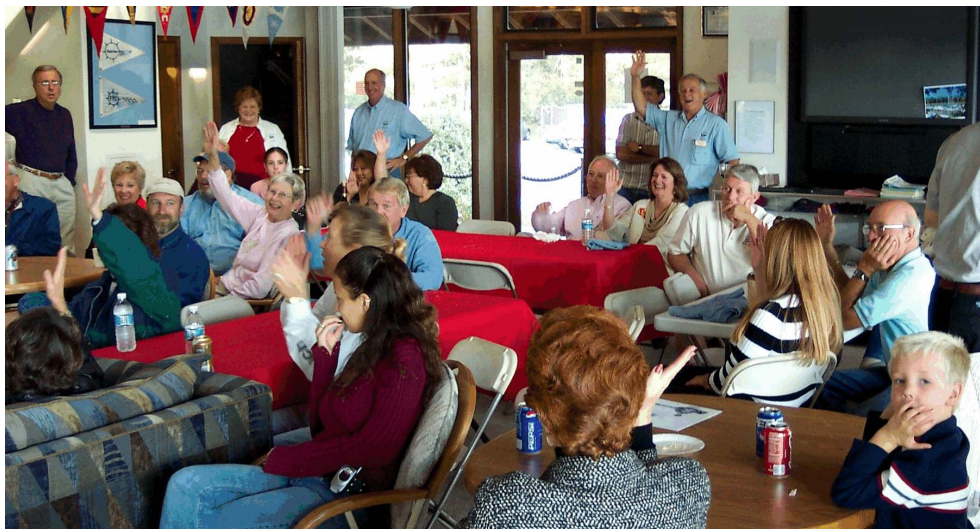
The Yeah's have it. Now what were we voting on??