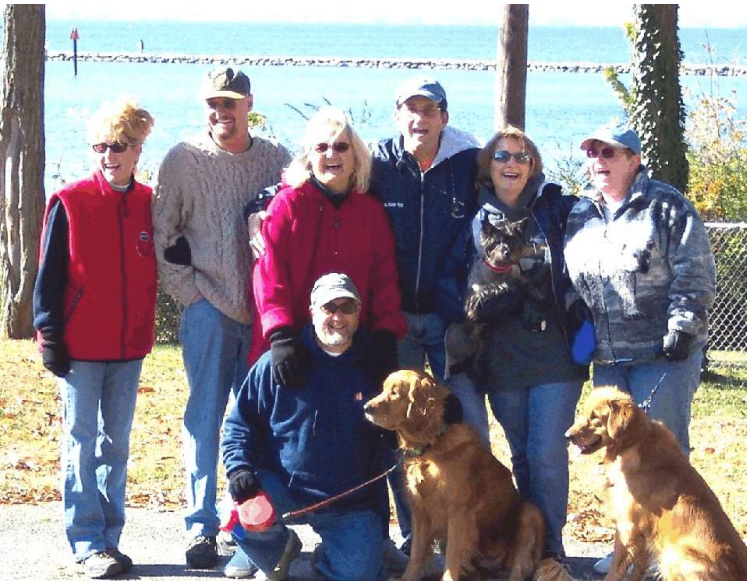
A Sunny But VERY Cold Day for a Walk.

the past two years. This year the participants voted on where to go and I decided that we would go back to Cobb Island like we did last year.