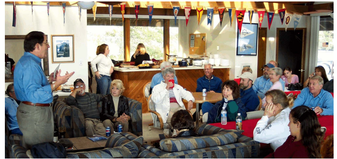
It's like this folks ... you Vote First, then Eat.