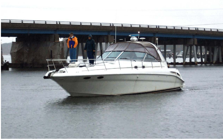
A Wet and Gloomy Arrival, If Not for the Wine.

The last cruise of the season is always the Hardy Souls Cruise and this has been an OYC tradition for all the years I have been a member of the Club. Normally we go to Old Towne, but the damage done by that pesky Isabel has meant that we have had to pick a different location for