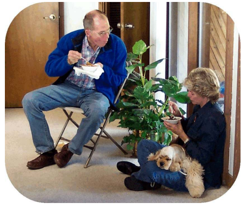
If you can't get anything to eat you might as well take a nap.