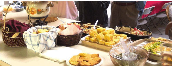
And this was before the food arrived.