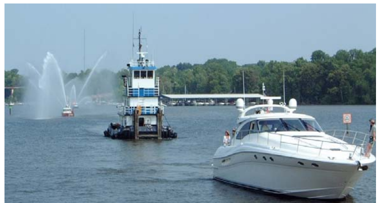
VIP boat leads the way for the Blessing of the Fleet. Between four and five hundred boats took part (actual number 178).